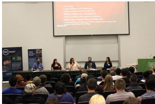
Ballston Spa students attended a panel discussion on millennials in manufacturing Wednesday, Oct. 5 at Hudson Valley Community College’s TEC-SMART facility in Malta.

The panel discussion gave students the chance to hear from young professionals making an impact in manufacturing and learn about the day in the life of a manufacturer. Panelists shared their stories and offered advice about manufacturing and innovation. Other topics discussed included new manufacturing technologies, the “maker culture,” workforce needs and career pathways.