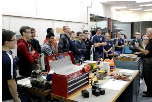
Clean Tech ECHS will take part in a host of events around the Capital District as part of National Manufacturing Month.