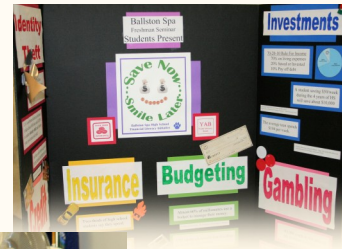
Ballston Spa 9th grade class presents a workshop on financial literacy as part of a grant provided by State Farm Insurance Company.