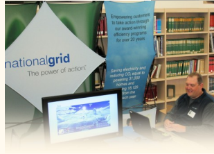
(left) National Grid volunteers discuss alternative energy resources at a symposium for our high and middle school students.