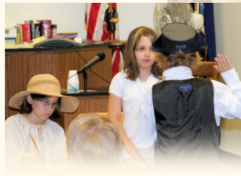
Ballston Spa Young Scholars hold a Mock Trial of the Oberlin-Wellington Rescue of 1858.

Partnership opportunities enrich the K-12 curriculum at Ballston Spa Schools by providing students and teachers with hands-on learning through internships, symposia, professional development and lecture series that include: