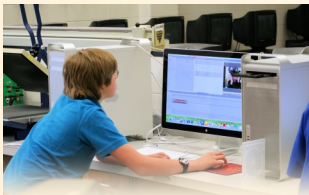
Students engage in digital video production.

Preparing students for jobs that do not yet exist in a world where information is growing exponentially requires educational experiences that provide new tools for teaching, assessment and professional development.