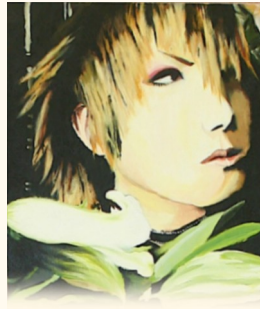
(left) A 10th grade student displays a piece of her own art work at the Ballston Spa Central School District Music and Art Festival.