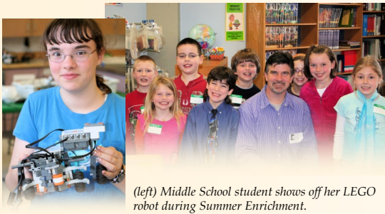
(left) Middle School student shows off her LEGO robot during Summer Enrichment.