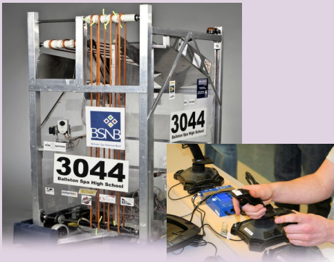
Our FIRST Robotics Team, the Robo-Nators, drove their robot to a successful competitive season. Robots were built and driven by our students.

To develop alternative resources as well as to support innovative programming, the district has partnered with the Community Foundation for the Greater Capital Region to receive donations and sponsorships under a 501 (c) (3) status. The field of interest fund will be known as the Ballston Spa Partnership for Innovation in Education Fund . It will allow for tax exempt status and will be used to benefit various educational and mission-related programs in the district, such as Sponsor a Scholar program, Robotics and other team expenses, summer engineering and the arts, Artist in Residence programs and future STEM initiatives.