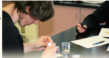
(right) High School students explore the intricacies of Nanoscience.